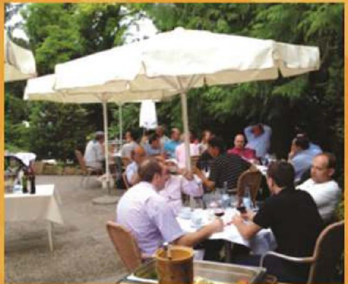
German Local Fresh Delicacy from Schonbuch Nature Park