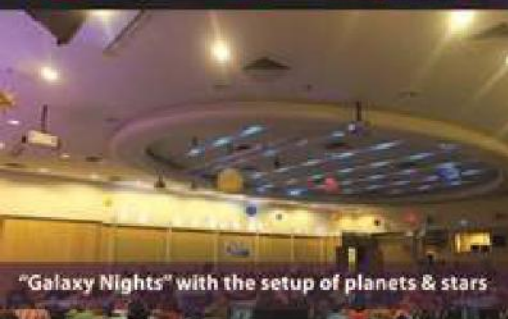
"Galaxy Nights" with the setup of planets & stars