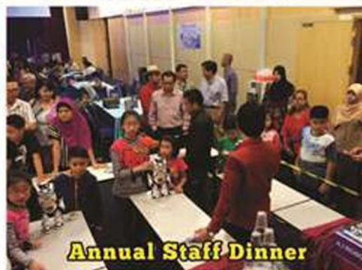
Annual Staff Dinner