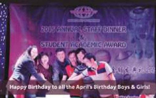
Happy Birthday to all the April's Birthday Boys & Girls!

The Management of GGOC would like to extend their deepest gratitude and appreciation for those staffs who attended the dinner. Hopefully, all Galaxians may turn up at all the upcoming events held with GGOC so that the spirit of togetherness and harmony could be preserved.