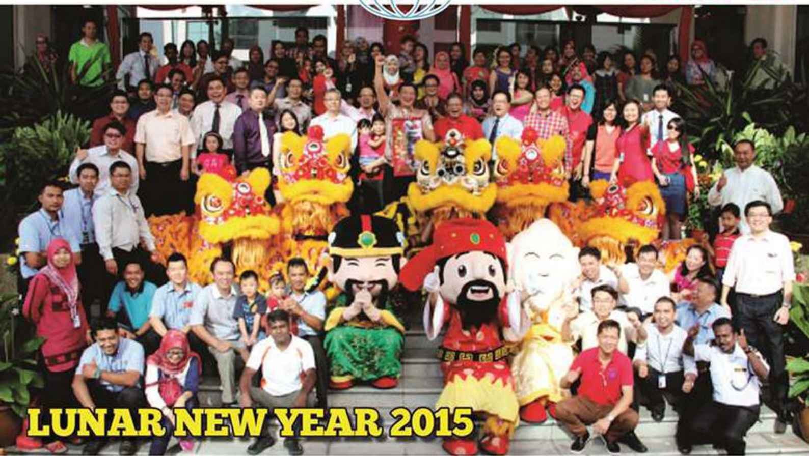
LUNAR NEW YEAR 2015