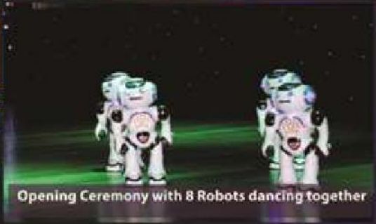
Opening Ceremony with 8 Robots dancing together