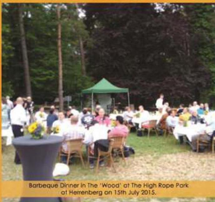
Barbeque Dinner In The 'Wood' at The High Rope Park at Herrenberg on 15th July 2015.