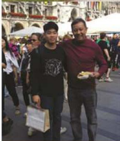
Enjoying German Sausages at Marienplatz, Munich