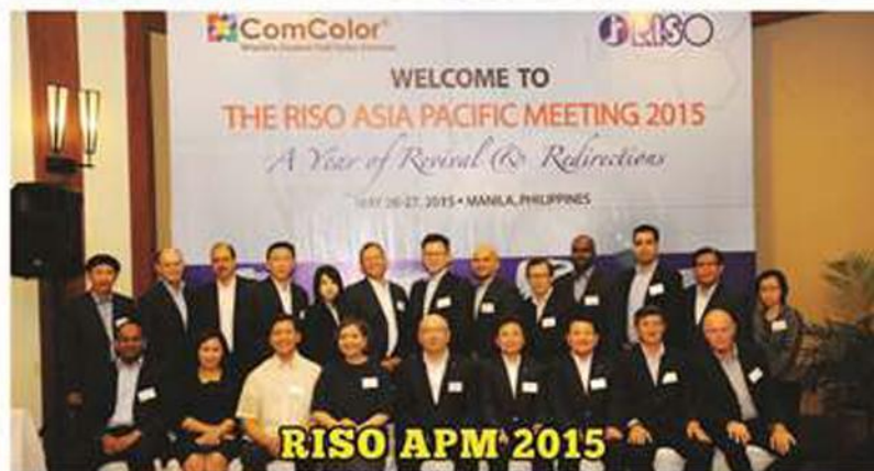
RISO APM 2015