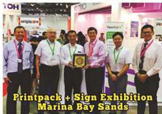
Printpack + Sign Exhibition Marina Bay Sands