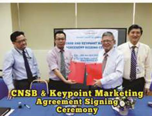
CNSB & Keypoint Marketing Agreement Signing Ceremony