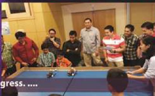
Robots Competition & Children Games in progress. ....