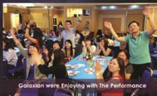
Galaxian were Enjoying with The Performance