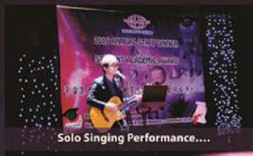
Solo Singing Performance....